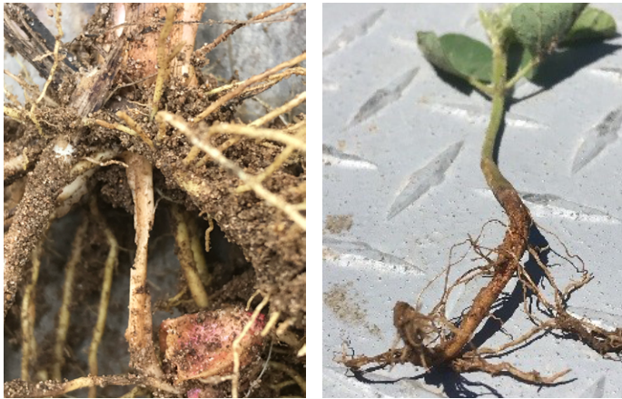
Figure 3. Root damage on corn and soybean seedlings caused by Asiatic garden beetle feeding in Indiana in 2018.