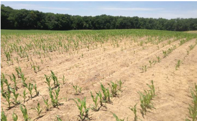
Figure 1. Asiatic garden beetle feeding may be scattered across a field, but the most severe damage is often concentrated in areas of intensive egg laying or better survival of larvae, commonly in sandy spots. Damage may be compounded by other factors affecting plant vigor.