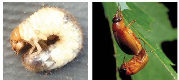
Figure 2. Asiatic garden beetle larva (left) with arrow indicating the enlarged maxillary palps, and adults (right).